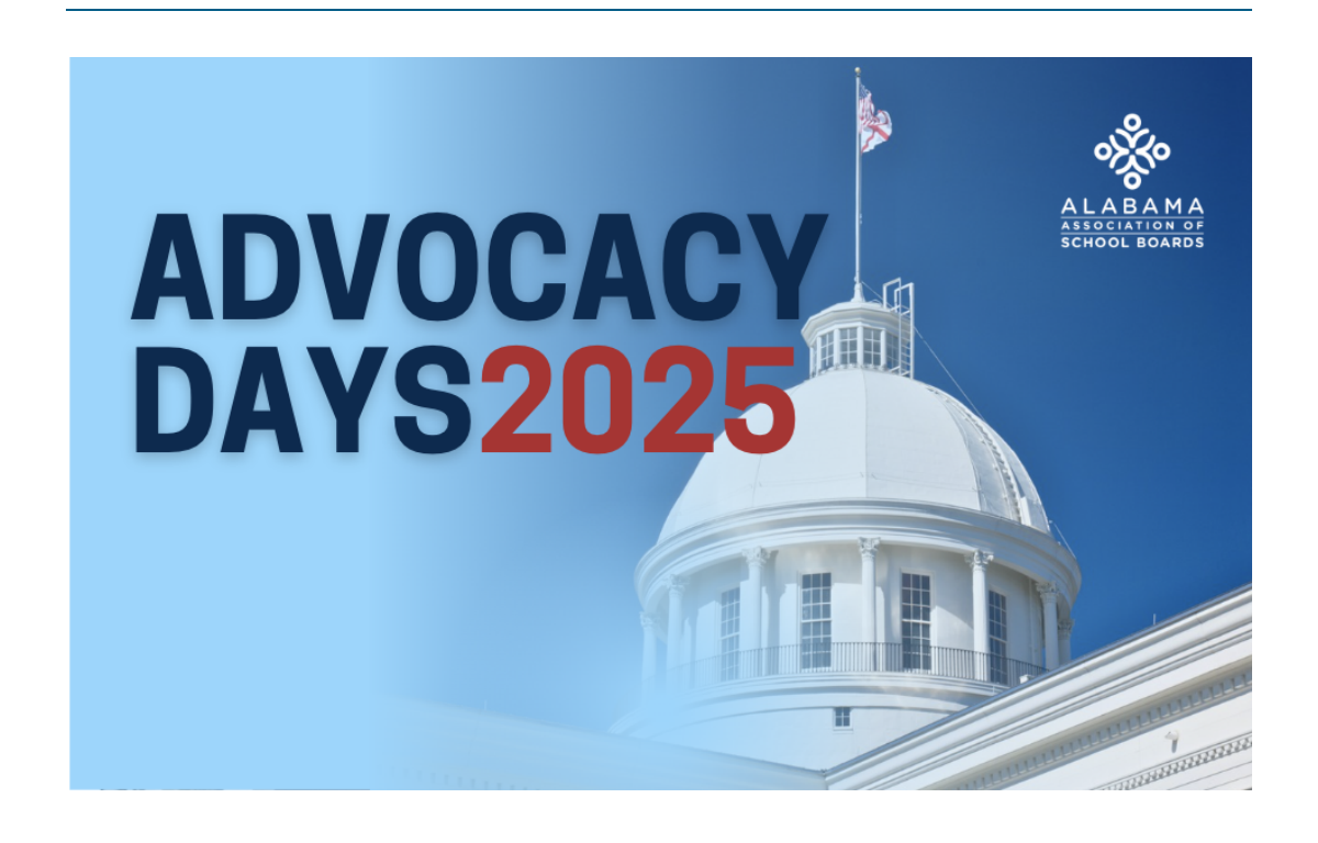
Advocacy 2025: Exclusive Opportunity to Attend Legislative Committee Days

REGISTRATION: Contact Your Board Secretary or AASB